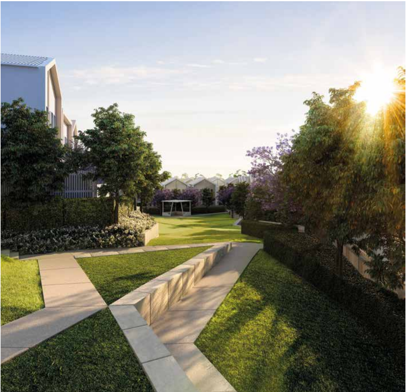
ARTIST IMPRESSION - INDICATIVE ONLY