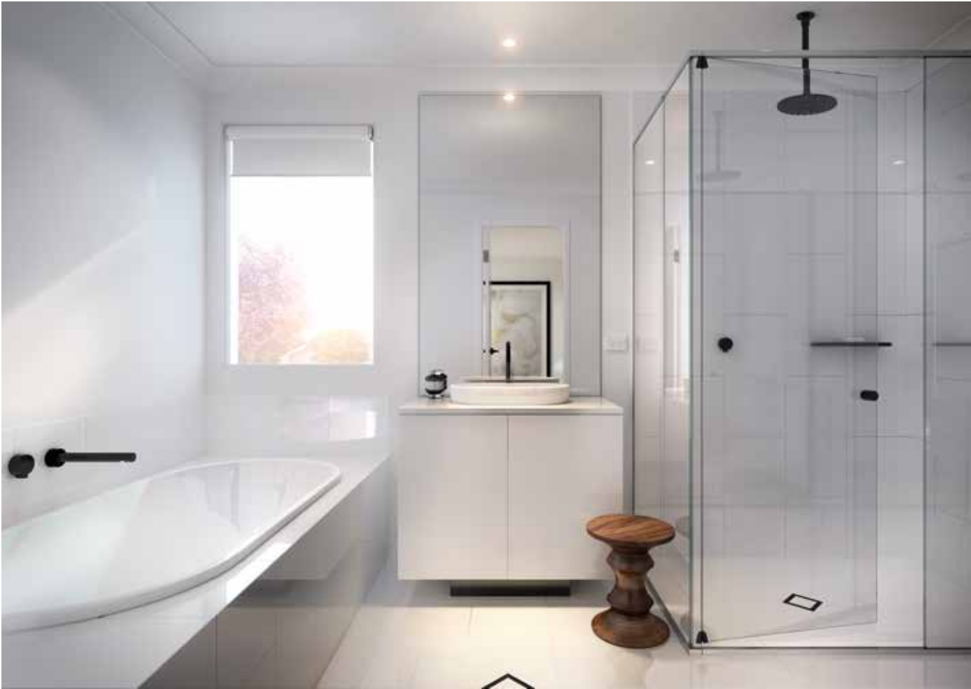
ARTIST IMPRESSION - INDICATIVE ONLY

BATHROOM DESIGN IS BEAUTIFUL AS WELL AS FUNCTIONAL, WITH LARGE PORCELAIN TILES, CUSTOM-MADE VANITIES, STYLISH RECONSTITUTED STONE BENCH TOPS, AND AN IMPECCABLE SELECTION OF PREMIUM FITTINGS.