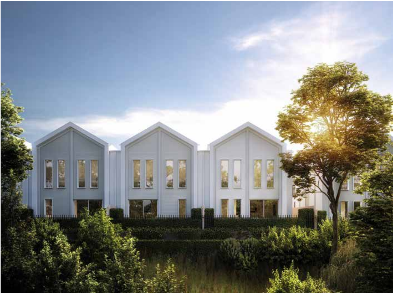
ARTIST IMPRESSION - INDICATIVE ONLY